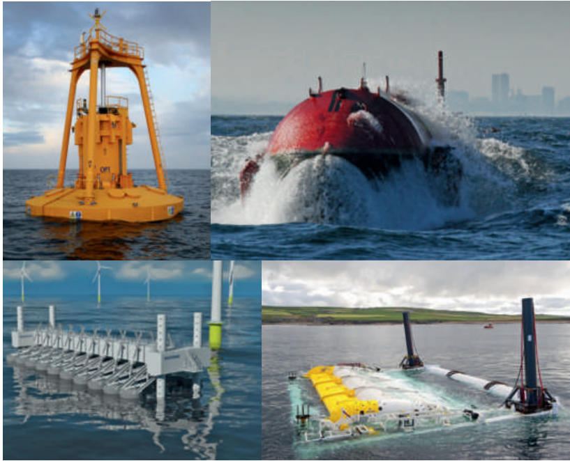
Photo: tl -Ocean Power Technologies Inc.; tr – Pelamis Wave Power; br – Wave Star AS; bl – Aquamarine Power.

The advantages of oscillating body converters include their size and versatility since most of them are floating devices. A distinct technology has yet to emerge and more research, to increase the PTO performance and avoid certain issues with the mooring systems, needs to be undertaken. Figure 3, shows some representative devices of oscillating bodies: the PowerBuoy of Columbia Power Technologies, Oyster (Scotland), Seatricity (Cornwall), Pelamis (Scotland) and Wave Star (Denmark) (Papaioannou, 2011; SI Ocean, 2012; IRENA, 2014).