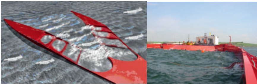
Figure 4: Overtopping wave power technologies: WaveCat (left) and Wave Dragon (right).

and.